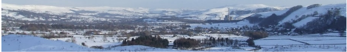
Hope Valley, Derbyshire